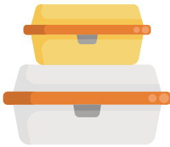
Store Food Correctly

There are three primary ways to reduce food waste in a commercial kitchen